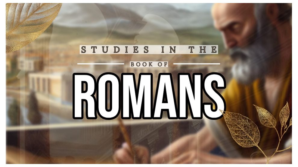
~ Experiencing God, Encouraging People~